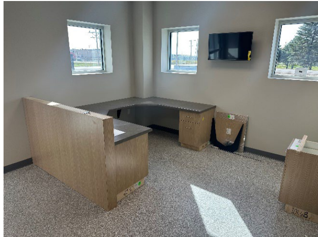
Front Office Area / Lobby