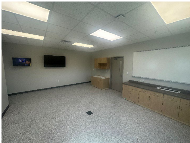
Conference / Training Room