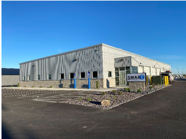
Outside of SMART office